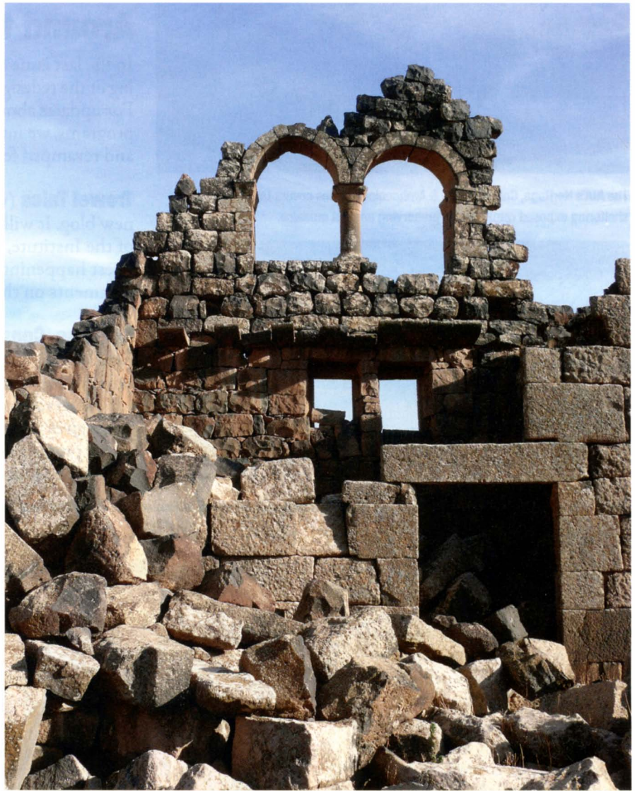
A double-arched window still stands at House XVIII, a major domestic complex at Umm el-Jimal.

The Umm el-Jimal Project is affiliated with the American Schools of Oriental Research (ASOR) and works in conjunction with Jordan's Department of Antiquities and Ministry of Education, the municipality and people of Umm el-Jimal, and Open Hand Studios.